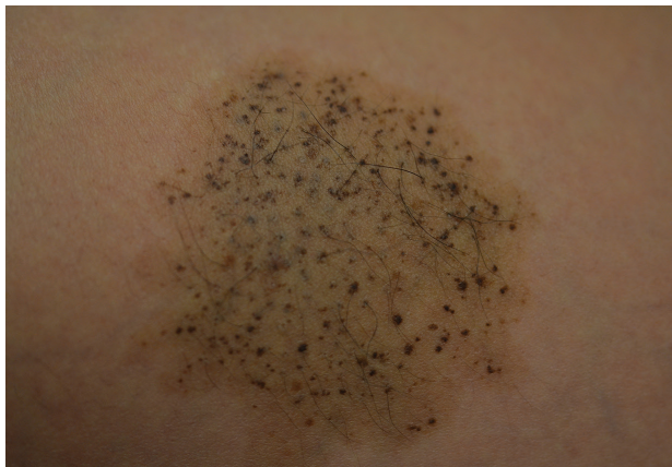
Figure 1. A 7×8-cm tan-brown macule studded with darker macules and slightly raised papules on the thigh that was later diagnosed as nevus spilus. Terminal hairs were present.

A 4-mm punch biopsy from one of the dark blue macules demonstrated uniform lentiginous melanocytic hyperplasia and nevus cell nests adjacent to the sweat glands extending into the mid dermis (Figure 2). No clinical evidence of malignant degeneration was present.