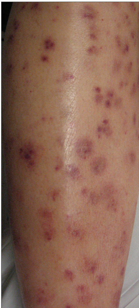
Figure 1. Rash on the left lower leg.

focal necrosis present in the dermis, dermis-subcutis junction, and subcutis (Figure 2). Diagnostic features of vasculitis were not seen. Viral cytopathic features were not identified. Tissue culture and special stains including Gram, acid-fast bacteria, and Grocott methenamine silver stains were negative for infectious organisms in the biopsy. Both direct fluorescent antibody study and cell cultures for varicella-zoster virus, cytomegalovirus, and herpes simplex virus also were negative.