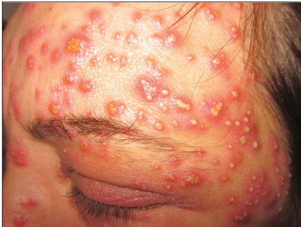
Figure 1. Multiple pruritic, erythematous and edematous lesions with multiple small nonfollicular pustules localized over the face.