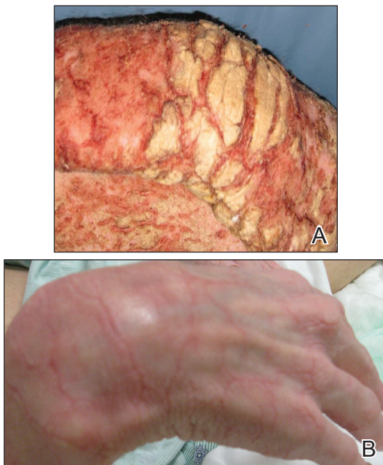
Figure 1. Hyperkeratotic lesions on the right hand before (A) and after 3 weeks of treatment with permethrin cream 5% and oral ivermectin (B).

Classic (noncrusted) scabies is common worldwide, with an estimated 300 million cases per year. It is caused by the mite Sarcoptes scabiei var hominis , and transmission occurs by direct skin-to-skin contact or less commonly by fomites (eg, linens, bedsheets) and