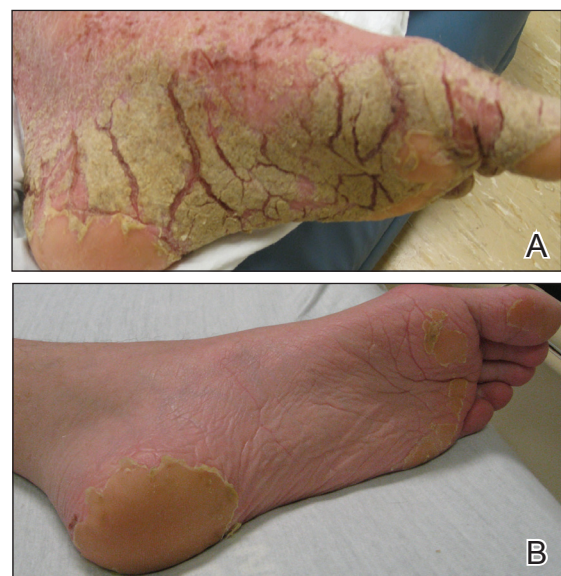
Figure 2. Hyperkeratosis and visible burrows on the left foot before (A) and after 3 weeks of treatment with permethrin cream 5% and oral ivermectin (B).