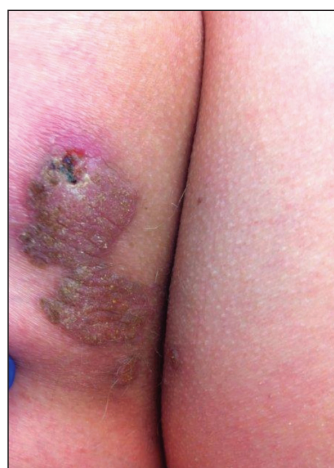
Figure 1. Verrucous porokeratosis. A unilateral hyperkeratotic plaque on the gluteal cleft that clinically resembled seborrheic keratosis.

A 40-year-old man who presented to the dermatology clinic for a follow-up on a basal cell carcinoma of the temple region was concerned about a lesion on the left buttock of 1 year's duration. Physical examination revealed a unilateral hyperkeratotic plaque that clinically resembled seborrheic keratosis (Figure 1). Biopsy revealed hyperkeratosis with numerous columns of parakeratosis, psoriasiform epidermal hyperplasia (Figures 2A and 2B), dyskeratotic keratinocytes (Figure 2C), pigment incontinence, and mild superficial chronic inflammation consistent with verrucous porokeratosis. The patient was treated with urea lotion but ultimately was lost to follow-up.