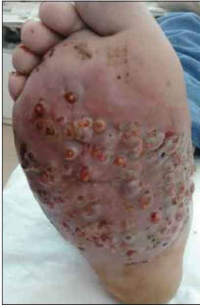
FIGURE 1. Local tumefaction, fistulated nodules, and abscesses discharging a serohemorrhagic fluid on the right foot of a patient with eumycetoma pedis.