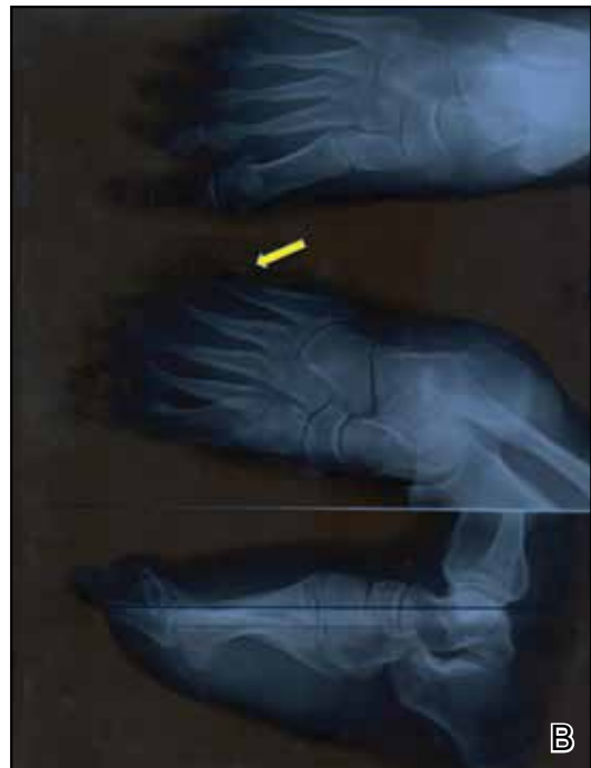
FIGURE 3. Relapse of the lesions (A) and diffuse osteolytic lesions (arrow) on bones in the right foot (B) were noted after treatment discontinuation.

grains, sclerotia) on histology produced by the etiologic agents. 2-4