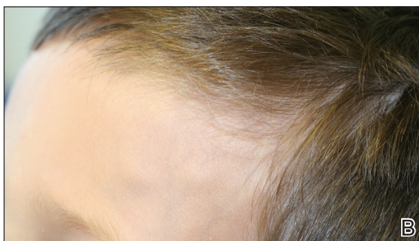
FIGURE 1. A, Anterior view of firm, flesh-colored, subcutaneous nodules on the forehead. B, Lateral view of firm subcutaneous nodules on the left side of the forehead and anterior scalp.