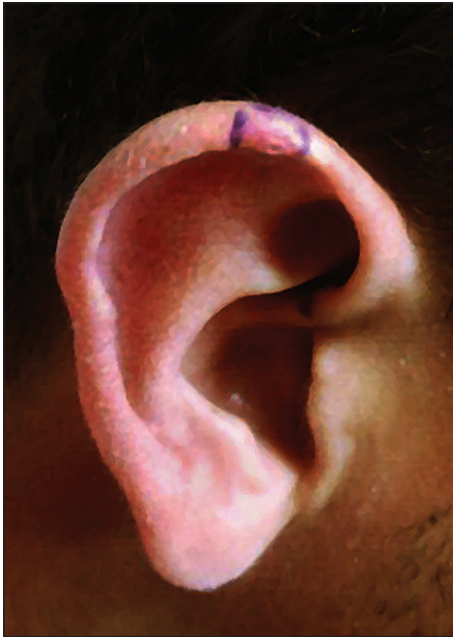
FIGURE 1. Chondrodermatitis nodularis helicis. An erythematous 7-mm papule with central ulceration on the right upper helix of 3 months' duration.

(Figure 2A). Biopsy in this patient demonstrated classic histopathologic findings of CNH, including a central area of epidermal ulceration capped by an inflammatory crust and an underlying edematous degenerated dermal collagen (Figure 2B).