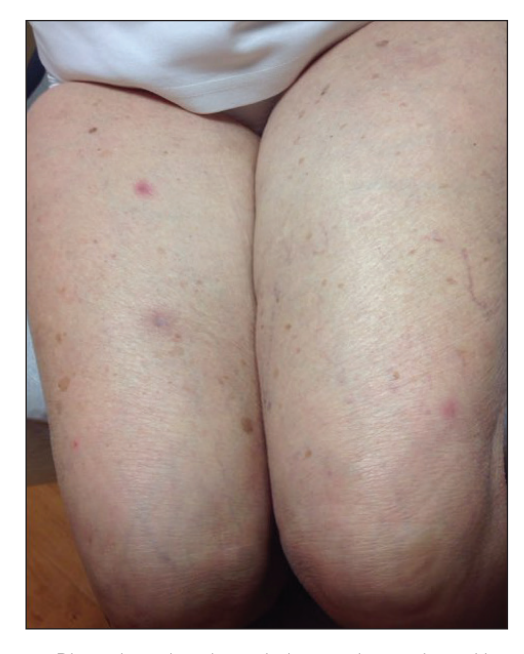
FIGURE 1. Disseminated erythema induratum in a patient with a history of tuberculosis. Violaceous, minimally tender, nonulcerated, subcutaneous nodules were present on the legs.

An 88-year-old woman presented for evaluation of violaceous, minimally tender, nonulcerated, subcutaneous nodules on the legs, arms, and trunk of several weeks' duration (Figure 1). She had a remote history of tuberculosis as a child, prior to the