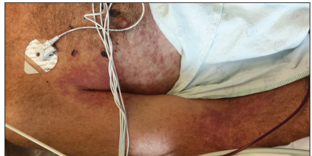
FIGURE 2. Near-complete resolution of erosions and hemorrhagic crusting after treatment with acyclovir.