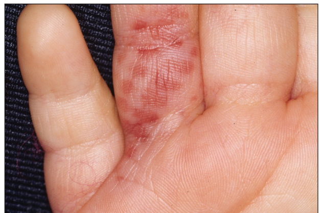
FIGURE 2. Gridlike pattern of hemorrhagic papules and crusts on the palmar aspect of the right hand following Megalopyge opercularis envenomation.

The most commonly reported immediate approaches to treatment involve attempts to remove the spines from the skin with tape (stripping), application of ice packs over the affected area, oral antihistamines, topical and intralesional anesthetics, regional nerve block, and oral analgesics. 6,9 There have been several cases detailing the successful use of parenteral calcium gluconate, 5,7 and diazepam has been used to treat severe muscle spasms. Anaphylactic reactions should be managed in a controlled monitored setting