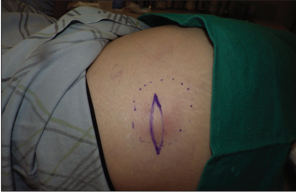
FIGURE 1. A soft, tender, erythematous subcutaneous mass on the right superior buttock.

culture, and antibiotic sensitivities. Necrotic-appearing adipose and fibrotic tissues were dissected and extirpated through an elliptical incision and submitted for pathologic evaluation.