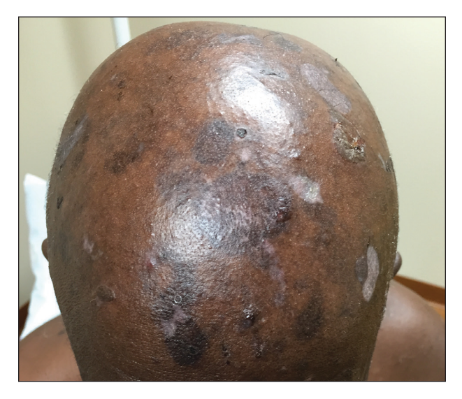
FIGURE 1. Drug-triggered bullous pemphigoid. Hypopigmented atrophic plaques and hyperpigmented plaques on the scalp.