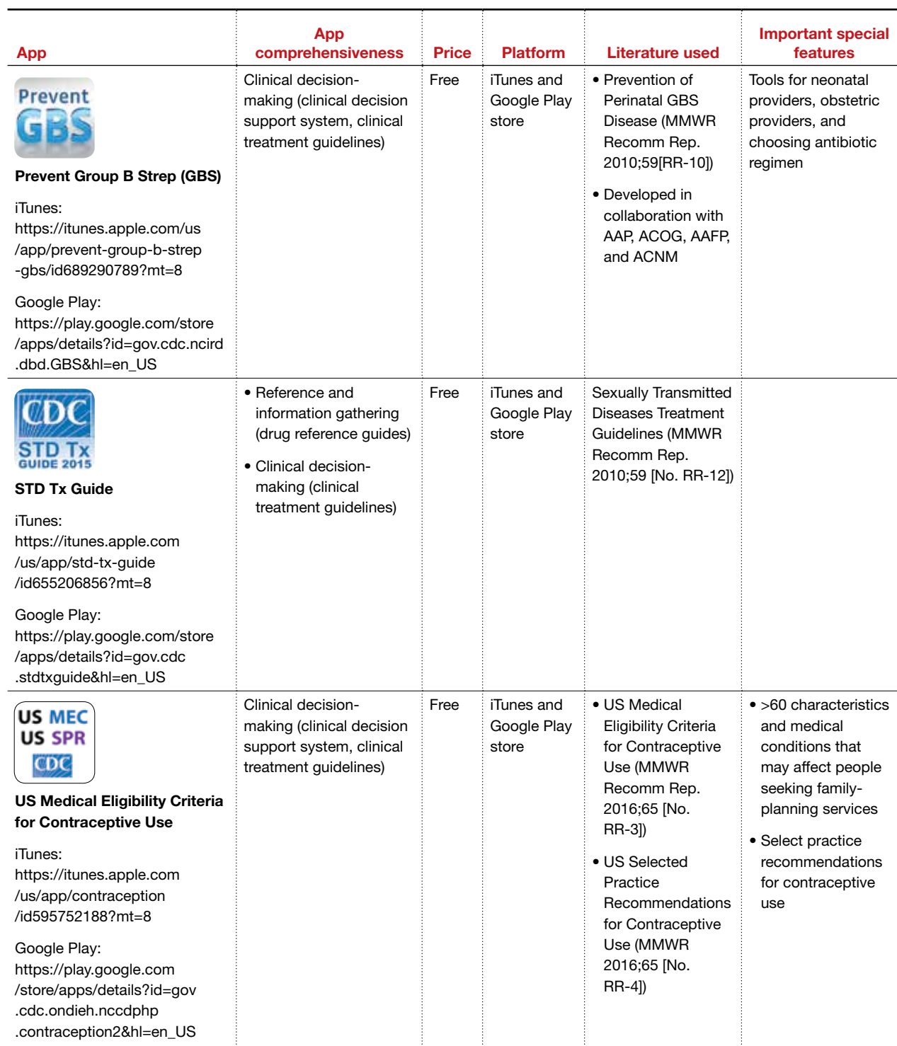
TABLE CDC applications for ObGyn health care providers

Abbreviations: AAFP, American Academy of Family Physicians; AAP, American Academy of Pediatrics; ACOG, American College of Obstetricians and Gynecologists; ACNM, American College of Nurse-Midwives.