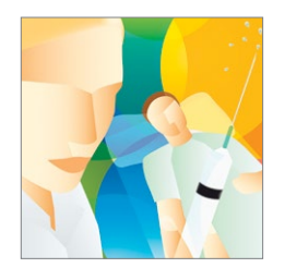
Immunizations for psychiatric patients