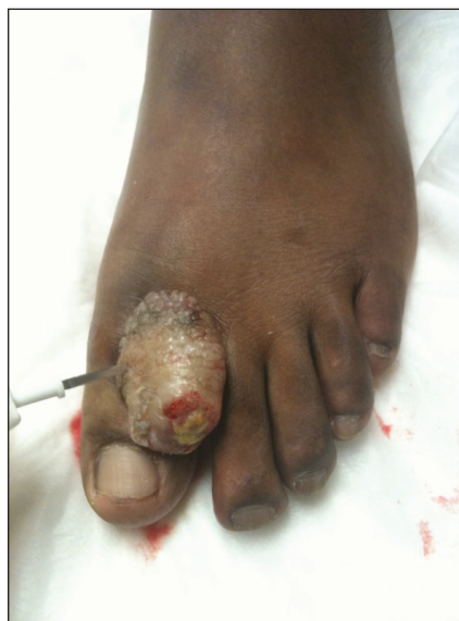
FIGURE 1. Flesh-colored, pedunculated, firm nodule on the lateral aspect of the left great hallux.

Histopathologic examination demonstrated a polypoid spindle cell tumor that filled the dermis and invaded into the subcutaneous adipose tissue (Figure 2). The spindle cells had tapered nuclei in a honeycomb arrangement with only mild nuclear pleomorphism arranged in fascicles with a herringbone formation. Areas showed a myxoid stroma with abundant mucin (Figure 3). Immunostaining demonstrated cells strongly positive for CD34 and negative for