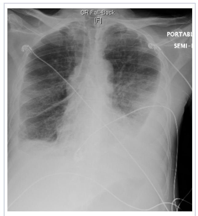
FIGURE 1 Chest X-ray showing bilateral pleural effusion blunting the costophrenic angles.

rax secondary to primary Kaposi sarcoma arising from the pleural region.6 One case report examined pleural and lung biopsies in a 34-year-old patient with AIDSrelated Kaposi sarcoma that showed immunohistochemical staining that was suggestive of early-stage Kaposi sarcoma of lymphatic endothelial origin. The authors were