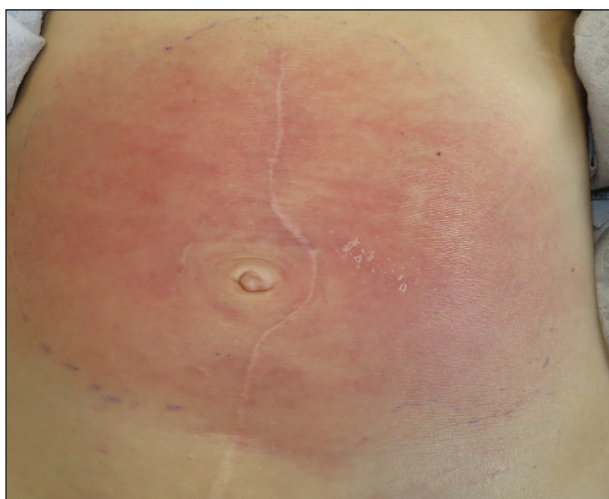
FIGURE 1. A well-demarcated, 15×20-cm, erythematous, blanching, indurated plaque on the periumbilical area that was diagnosed as carcinoma erysipeloïdes.

(reference range, 4500–11,000/ \mu L). Physical examination revealed a well-demarcated, 15×20-cm, erythematous, blanchable, indurated plaque in the periumbilical region (Figure 1). The plaque was tender to palpation with guarding but no increased warmth. Punch biopsies of the abdominal skin revealed carcinoma within the lymphatic channels in the deep dermis and dilated lymphatics throughout the overlying dermis (Figure 2). These findings were diagnostic for carcinoma erysipeloïdes. Tissue and blood cultures were negative for bacterial, fungal, or mycobacterial growth. Vancomycin was discontinued,