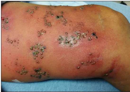
FIGURE 1. Herpes zoster with grouped vesicles on the left thigh following acute reactivation of varicella-zoster virus.

Physical examination was remarkable for an extensive rash consisting of multiple 1-cm clusters of approximately 40 pustules each scattered in a nondermatomal distribution along the left leg (Figure 1). Many of the vesicles were confluent with an erythematous base and were in