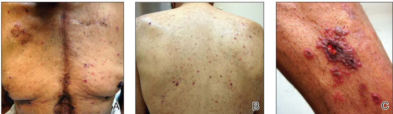
FIGURE 2. Herpes zoster with diffuse vesicles on the chest (A) and back (B), as well as a hemorrhagic, necrotic, vesiculobullous lesion with surrounding vesicles on the left leg (C), following acute reactivation of varicella-zoster virus.

Given a clinical suspicion for disseminated HZ, therapy with oral valacyclovir was initiated. Two punch biopsies were consistent with herpesvirus cytopathic changes. Multiple sections demonstrated ulceration as well as acantholysis and necrosis of keratinocytes with multinucleation and margination of chromatin. There was an intense lichenoid and perivascular lymphocytic infiltrate in the dermis. Immunohistochemistry staining was positive for