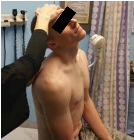
Figure 1. Spurling Test for Cervical Radiculopathy