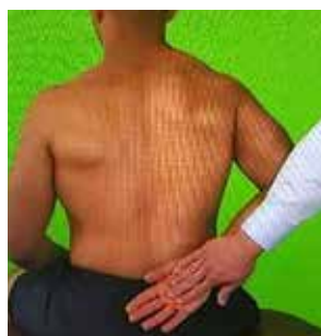
Figure 5. Liftoff Test for Subscapularis Muscle Dysfunction