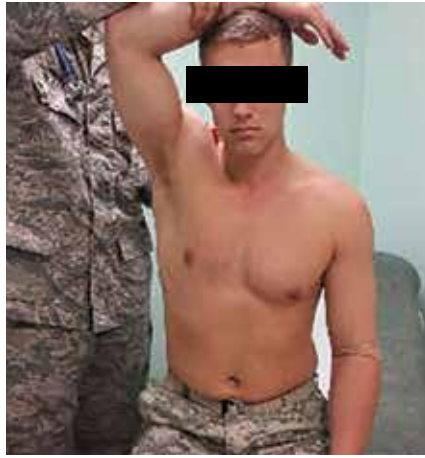
Figure 2. Shoulder Abduction Test for Cervical Radiculopathy