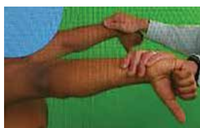
Figure 6. Empty Can Supraspinatus Strength Test

The final diagnosis was cervical radiculopathy of C5/6 nerve root due to left paracentral disc herniation with concomitant cord compression as well as external impingement (rotator cuff dysfunction) of the right shoulder. It is unclear whether the disc herniation contributed to the external shoulder impingement due to alterations in biomechanics or whether the 2 diseases were unrelated.