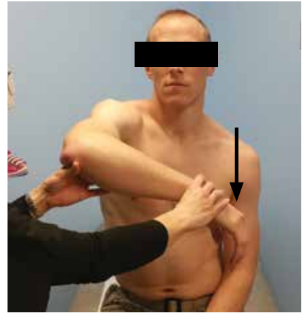
Figure 3. Hawkins Test for Shoulder Impingement