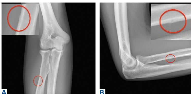
Figure 1. Red circle on (A) oblique and (B) lateral radiographs of the right elbow shows the location of the stress fracture.

When the intensity or frequency of physical activity is increased, as with overuse, bone resorption