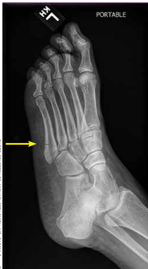
FIGURE 1 Proximal fifth metatarsal Jones fracture