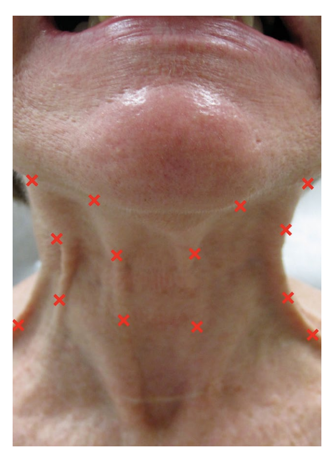
Figure 6. Typical injection points for the jawline and platysma.

to inject small aliquots of neurotoxin into the nasalis during glabellar treatment to avoid recruitment of this area after glabellar complex paralysis. The presence of bunny lines in the absence of glabellar frown lines often is sited as a telltale sign of toxin treatment, which may be disturbing to patients that want a natural effect. No placebo-controlled clinical trials have evaluated the use of any neurotoxin product in the treatment of this area.