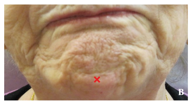
Figure 5. Injection sites for treatment of the depressor anguli oris (A). Injection site to treat the mentalis: peau d'orange chin (B).