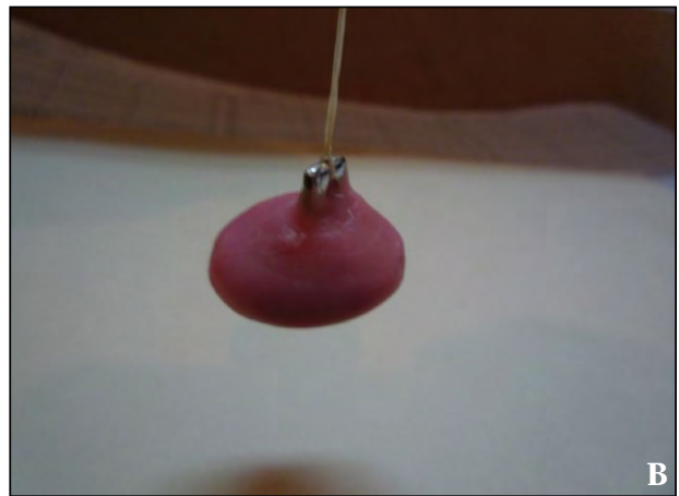
Figure 2. A lead shield was inserted beneath the eyelid prior to radiation therapy (A). The wax-covered lead shield protected the patient's eye during radiation therapy for the eyelid (B).

prophylactically twice daily during the treatment period. All patients received hyperfractionation treatment consisting of 2 fractions (treatments) a day for 20 days; over the course of treatment, each patient received a total of 40 fractions. Each fraction was 130 rads and patients received a total dose of 5200 rads.