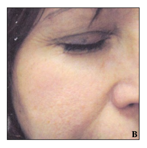
Figure 4. Nodular basal cell carcinoma of the eyelid (arrow) in a 44-year-old woman before (A) and 1 month after radiation therapy (B).

for the last 23 years. Following our protocol, we have not observed any scarring of the eyelids at 1 year or 20 years following treatment.