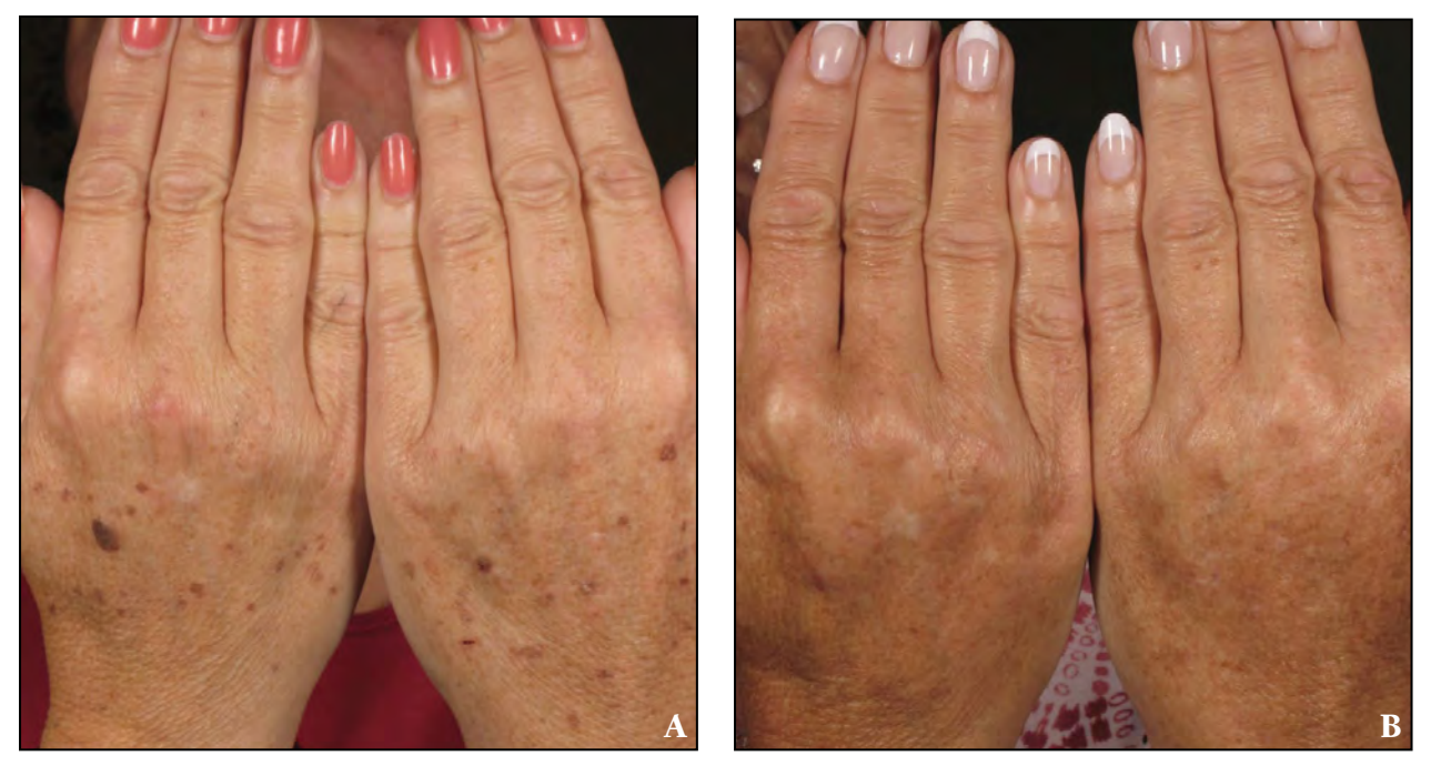
Figure 1. Hands with photodamage before (A) and after treatment with Q-switched alexandrite laser (755 nm), cryosurgery, and calcium hydroxylapatite filler (Radiesse, Merz Aesthetics, Inc)(B).