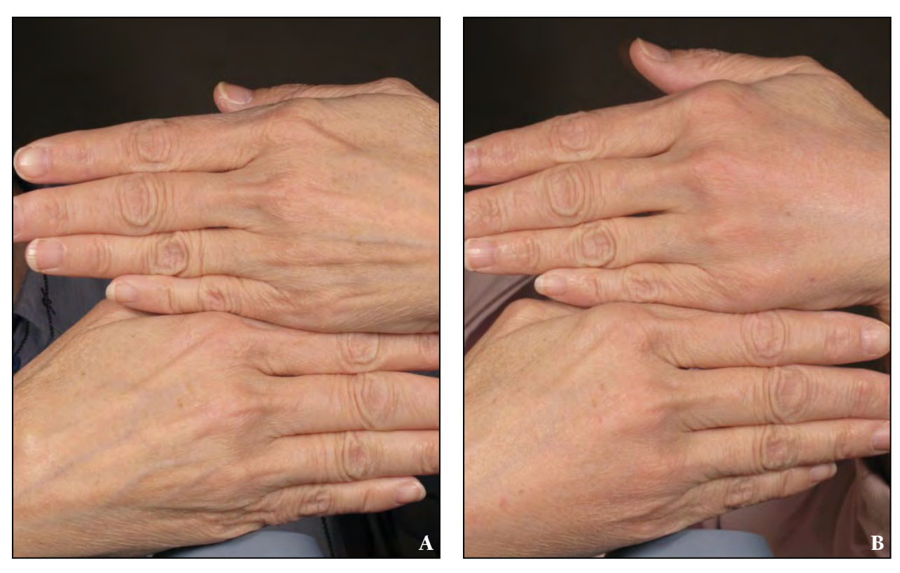
Figure 2. Hands before (A) and after treatment with calcium hydroxylapatite (Radiesse, Merz Aesthetics, Inc)(B).