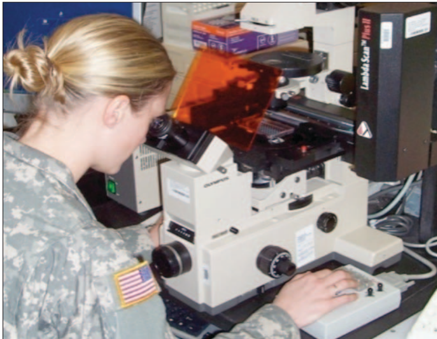
Figure 3: Reading HLA trays with a fluorescent microscope.

HLA Class I antigens (A, B, and C loci) are identified using T cells, and HLA Class II antigens (D/Dr locus) are identified using B cells. The use of antibody-coated magnetic beads is an attractive method for separating T and B lymphocytes, because it is a relatively quick, easy, and inexpensive procedure with high selectivity. Magnetic beads are coated with specific antibodies against Class I and Class II HLA antigens, found on T and B lymphocytes, respectively. The beads are mixed with the lymphocyte cell suspension and a magnet is placed alongside the tube in order to draw the magnetized B or T lymphocytes to the sidewall. After washing, the desired cells are tightly adherent to the sidewall of the tube, against the magnet, retaining lymphocytes while disposing of unwanted platelets, red cells, and other cellular debris.