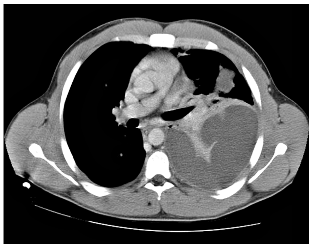
Figure 3. Computed Tomography of the Chest on Admission, Showing a Left-Side Pleural Effusion.