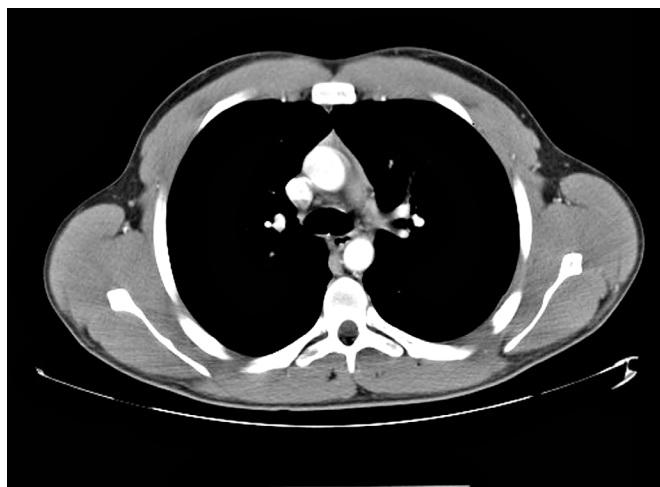
Figure 4. Computed Tomography of the Chest Posthospitalization, Showing Complete Resolution.

catheter line was placed for daily IV ceftriaxone infusions to be continued with oral clindamycin for the subsequent 4 weeks. A CT scan of the chest at 8 weeks posthospitalization revealed minimal postoperative scarring, and pulmonary function tests showed normal flow volume loop and maximum voluntary ventilation (Figure 4). The patient reported full recovery and was returned to full activity, including further Special Operations training.