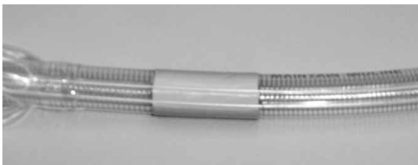
Figure 2. Closeup of electrodes of the EMG tube. This area has to be confirmed to be at vocal cord level, which is required for EMG vocal cord monitoring.

4% lidocaine. The patient's anatomy precluded the use of superior laryngeal nerve blocks. During the dexmedetomidine loading, he was given 1 mg midazolam and 100 µg fentanyl IV incrementally. No significant hemodynamic or respiratory changes occurred with this sedation regimen.