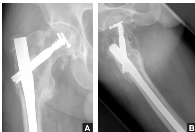
Figure 4. Final anteroposterior (A) and lateral (B) plain films obtained 7 months after trauma show healed fractures. Heterotopic ossification in the quadriceps muscles is also noted.

The Pipkin classification of femoral head fractures is a useful predictor of outcomes. 3,4 As Pipkin indicated, type I fractures occur caudad to the fovea, type II occur cephalad to the fovea, type III have an associated femoral neck fracture, and type IV have an associated acetabular fracture.