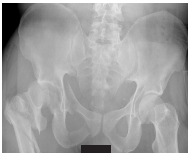
Figure 1. Anteroposterior pelvis plain film shows right femoral head fracture-dislocation with intertrochanteric femur fracture as well as right superior and inferior pelvic rami fractures.

and internal fixation (ORIF). He was returned to the operating room on postoperative day 5. The anterior approach was used to remove several small loose osteochondral fragments from the hip, and the femoral head fracture fragment was reduced and fixed with 2 countersunk 4.0-mm cancellous screws. Intraoperative fluoroscopy showed that the hip had full, smooth range of motion without fracture displacement. Postoperative x-rays showed successful reduction and fixation of the fracture (Figure 3).