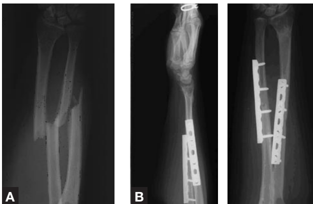
Figure 2. (A) Injury film of a 58-year-old woman with a left forearm fracture of both bones. (B) Three-month follow-up radiographs of healed fractures using minimal fixation.

by the operating surgeon (Dr. Anglen), without protocol and before the issue was the object of a study. There were no clearly identified reasons for choosing between the techniques; at that time, the preferred technique was evolving toward minimal plate fixation.