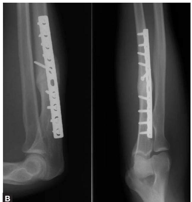
Figure 4. (A) Immediate hardware failure due to inadequate plate length in an isolated ulna fracture. (B) Radiographs 10 months after revision to a longer plate reveal a united fracture.