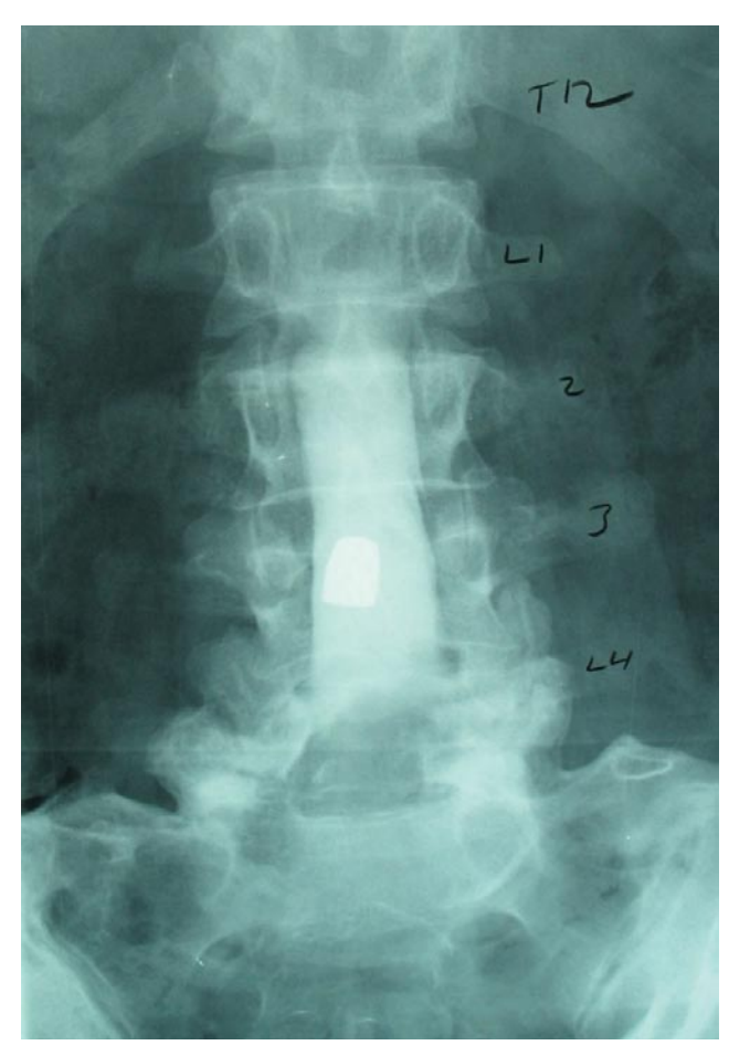
Figure 3. Anteroposterior x-ray myelogram shows missile at L3. Again note change in bullet orientation and in position from Figures 1 and 2.

specifically addressing the timing of treatment after spinal gunshot injuries must be conducted to provide evidence for optimal management.