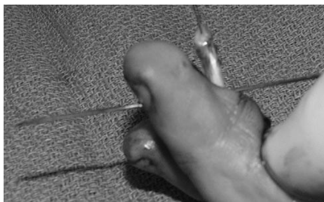
Figure 4. Flexor digitorum profundus (FDP) tendon prepared for attachment.

Because of extreme tenderness and the patient’s reticence to actively flex the finger, a digital local anesthetic block was performed in the office, and without pain he was still unable to flex the DIP joint.