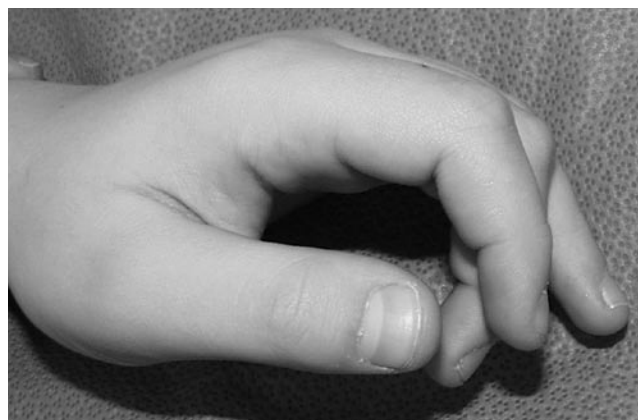
Figure 1. Absence of ring finger flexion at the distal interphalangeal (DIP) joint.

On physical examination, the patient's left ring finger was ecchymotic and swollen. He had full range of motion on active flexion of the proximal interphalangeal joint of the ring finger, but active flexion of the DIP joint was absent and produced pain in the palm (Figure 1). There was tenderness along the entire course of the flexor tendon sheath. Two-point discrimination was normal on the entire left hand, except at the distal tip of the ring finger.