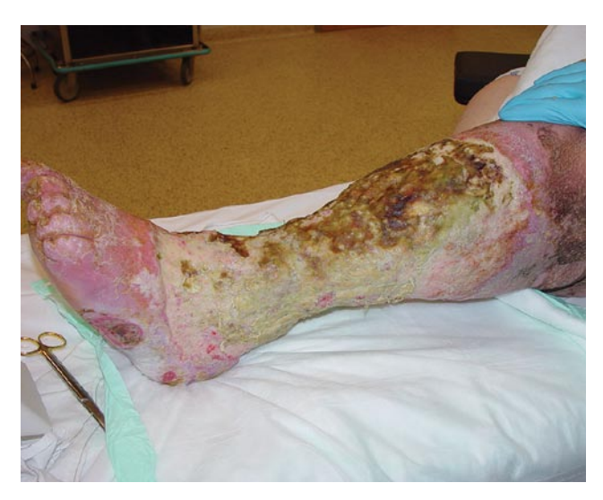
Figure 3. Left lower extremity purulent lesion presenting 3 years after right lower extremity amputation. This neoplasm also originated in a burn scar.

An aggressive surgical approach has become the most appropriate management for Marjolin ulcers. <sup>8,12</sup> Many of these ulcers appear subsequent to full-thickness burns that were not grafted during initial treatment and were allowed to heal spontaneously. <sup>1</sup> The etiology is again unclear, but most reports detail chronic irritation and the burn mechanism, thermal being the most common, as contributing to the pathophysiology. <sup>5</sup> More recent theories have included genetic postulations involving human leucocyte antigen (HLA) DR4 and mutations in the p53 and/or Fas genes. <sup>10,13-15</sup>