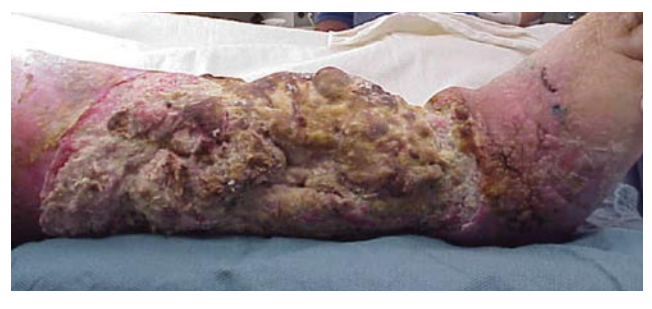
Figure 1. Right lower extremity purulent fungating lesion originating from a scar from a burn injury sustained 45 years earlier.

Marjolin ulcer is a carcinoma, commonly squamous cell, that develops in a chronically inflamed, traumatized, or scarred area of the skin. Early in the first century, Celsus was the first to describe a neoplasia that developed in a chronic ulcer.<sup>3</sup> The term Marjolin ulcer is associated with this finding because of Marjolin's 1828 description of malignant lesions that developed in scar areas.<sup>4</sup> There is controversy about who first described the condition, but Marjolin has continued to receive the credit.