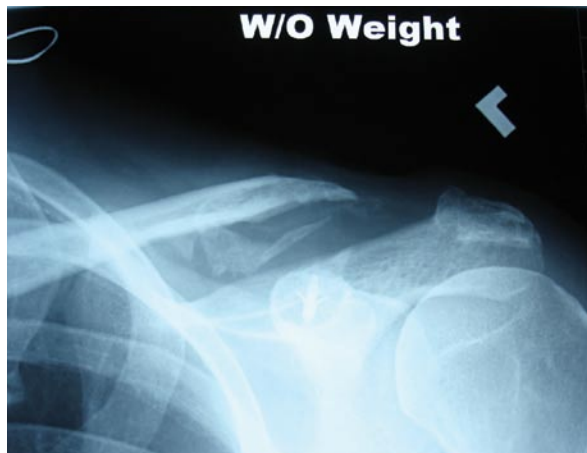
Figure 3. Twenty-five months after surgery, x-ray without weight shows mild increase in coracoclavicular distance and calcification of coracoclavicular ligaments.

ligament stumps. This suture position also ensures that the distal clavicle is not translated anteriorly, subluxating the AC joint, as commonly happens when sutures are looped around the clavicle and the coracoid. It is important to remove excess bone and to