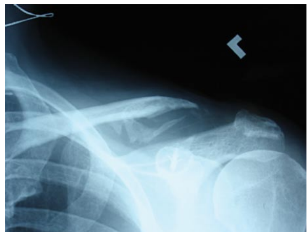
Figure 4. Twenty-five months after surgery, x-ray with 10-lb weight in left hand shows stable mild increase in coracoclavicular distance.

ligament stumps. This suture position also ensures that the distal clavicle is not translated anteriorly, subluxating the AC joint, as commonly happens when sutures are looped around the clavicle and the coracoid. It is important to remove excess bone and to