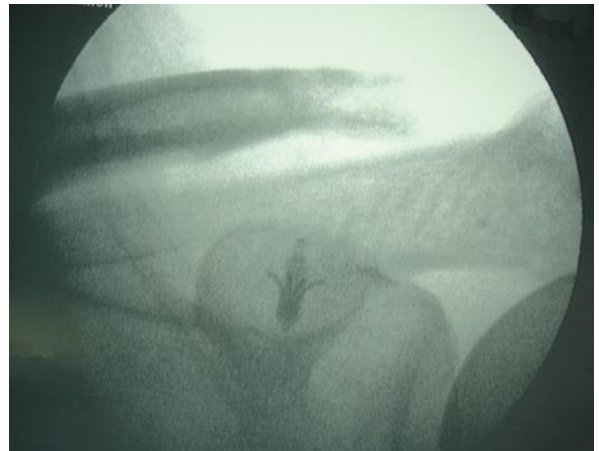
Figure 2. Intraoperative x-ray status-post suture anchor fixation and distal clavicle excision secondary to acromioclavicular joint degeneration.

Under regional interscalene anesthesia and with the patient in the beach-chair position, the arm and shoulder region are prepped and draped, taking care to medialize the sterile field toward the base of the neck. An anteroposterior saber incision 5 to 7 cm in length is made over the distal clavicle at the level of the coracoid process after the skin has been injected with a local anesthetic-epinephrine mixture. Subcutaneous