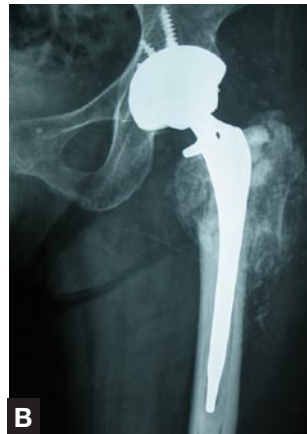
Figure 4. (A) Preoperative anteroposterior radiograph of woman in her early 70s 8 months after sliding hip screw fixation of an intertrochanteric fracture. The patient presented with severe pain and a limp that limited ambulation. The radiograph shows a malunited intertrochanteric fracture with medialization of the femoral canal, intramedullary remodeling around the lag screw tract, and lag screw cut out of the femoral head. (B)

Postoperative conversion total hip replacement using a cemented stem shows proper position of the prosthesis, good cement technique, correction of limb-length discrepancy, and restoration of abductor position and length. The trochanteric fragments had united previously. The excised femoral head was morselized and used as a bone graft laterally.