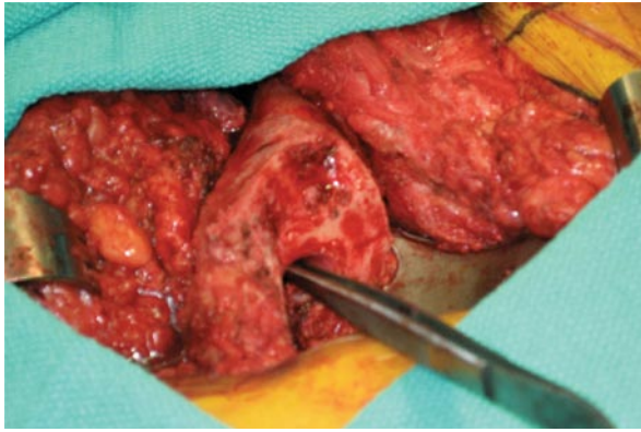
Figure 2. Intramedullary remodeling and sclerosis around lag screw results in obliteration of the femoral canal, leaving a large hole as a false tract (pointed by the forceps).

trochanteric fragment is malunited or not united, other landmarks must be used. The femoral head together with the lag screw is taken out in retrograde fashion (Figure 1). The plate and screws over the lateral femoral cortex are exposed and removed through a longitudinal split posteriorly over the vastus lateralis muscle. We always prepare the femur first for hip replacement because it is adequately exposed at this point.