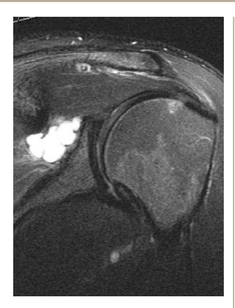
Figure 3. Preoperative magnetic resonance imaging of a typical spinoglenoid notch cyst.

tion was noted with healing of labral repairs in each patient (Figures 3, 4). All patients returned to their normal work and sporting activities without limitation, and all had improved external rotation strength. There were no complications.