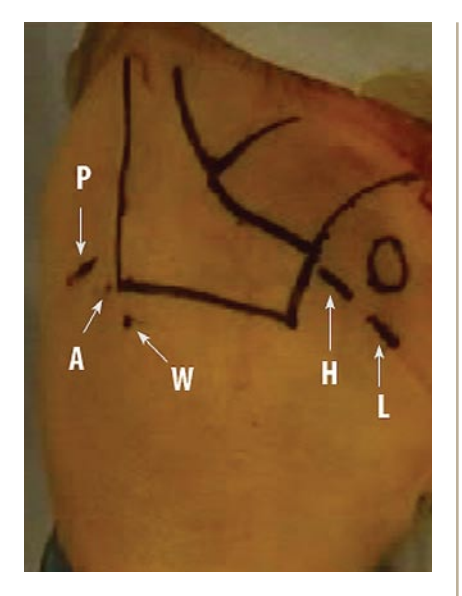
Figure 1. Superior view of the shoulder in beach-chair position. Standard posterior portal (P), high (H) and low (L) rotator cuff interval portals, and port of Wilmington (W) are marked in preparation for superior labral repair. Spinal needle aspiration entry site (A) is located about 1 cm lateral to the posterior portal.

potential nerve injury, cyst decompression "through the labral tear" has been combined with labral repair, though follow-up MRI showed only 80% complete cyst resolution with this technique.4