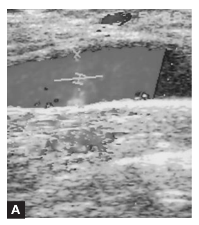
Figure 1. (A) Full longitudinal color flow image of common femoral vein in which venous flow volume is measured. (B) Waveform of autotraced Doppler signals of flow velocities of common femoral vein.

Our results demonstrate that venous stasis in operated lower limbs without DVT persists until at least 1 week after