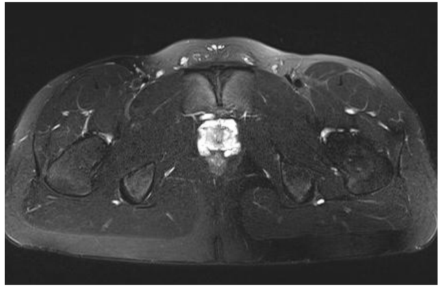
Figure 4. Axial T 2 -weighted magnetic resonance imaging of patient's hips 6 months later shows almost complete resolution of effusion.

A surgical drainage was to be considered if the patient