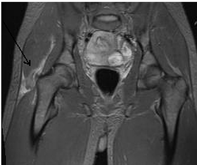
Figure 1. Coronal T 2 -weighted magnetic resonance imaging of 15-year-old male patient hips shows fluid accumulation in greater trochanteric region on right (thin arrow).

A 15-year-old boy was brought to the hospital by ambulance with a 1-day history of severe right hip pain and inability to weight-bear. Previously, he had been generally fit and well, and he had no history of recent trauma, illness, or foreign travel. On clinical examination, he was pyrexial (38.5°C) and tachycardic (heart rate, 107 bpm). He appeared uncomfortable in bed and was trying to avoid lying on the affected hip, being held in slight flexion. There was no apparent swelling, erythema, or rash over the leg. The patient had severe tenderness over the lateral aspect of the thigh from the greater trochanter to the midhigh region and decreased range of painful hip motion (flexion, 70°; external rotation, 40°; internal rotation, 15°); the pain was elicited mainly on flexion and internal rotation of the leg. Two inguinal lymph nodes were palpable in the right