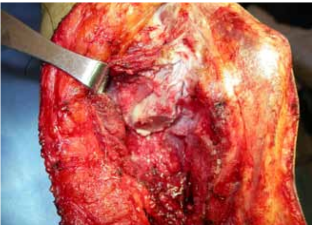
Figure 3. Radial head is resected.

prepped and draped in normal fashion, and a sterile tourniquet was applied to the arm. A posterior incision was made and carried through the subcutaneous tissue. Full-thickness skin flaps were raised medially and laterally. The lateral skin flap was developed until the brachialis muscle was identified. The brachioradialis-brachialis interval was identified. Then the radial nerve was addressed. It was identified proximally and then dissected out distally, including the posterior interosseous nerve, just distal to the elbow. The nerve was protected during the entire case (Figure 2). The extensor muscles were elevated off the lateral column, and an extensive anterior and posterior capsulectomy was performed. An osteotome was used to remove all visible heterotopic bone. The proximal radial head was then resected, and the olecranon fossa was débrided (Figure 3). The attenuated lateral collateral ligament complex was identified and protected. The radial head was completely devoid of viable cartilage. At the time of resection of the radial head, a significant increase in ROM was achieved.