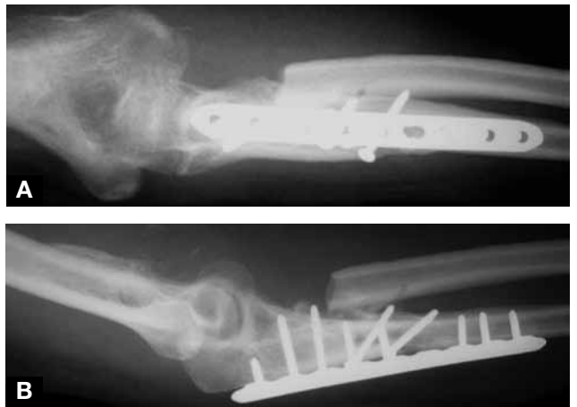
Figure 5. Final postoperative (A) anteroposterior and (B) lateral radiographs show synostosis removal, radial head resection, and realignment of forearm with ulnar osteotomy.

site was identified and mobilized with the use of a combination of osteotomes and sharp curettes. It was then aligned at the proper length and rotation and was plated in compression with local autogenous bone graft (Figure 4). This osteotomy brought the radius and ulna into proper anatomical alignment. After the incisions were closed, ROM was from full extension to 150° of flexion (Figure 5).