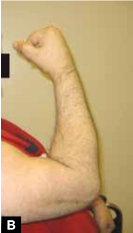
Figure 6. Clinical photographs 30 months after surgery show current arc of elbow motion from (A) extension to (B) flexion.

every attempt should be made to reduce the radial head. The radial head can be reduced up to 6 years after injury by performing a straightening ulnar osteotomy and radial shaft shortening osteotomy. 1 Other surgeons have managed these fractures with gradual lengthening of the ulna by external fixation. 2 In some cases, annular ligament reconstruction has assisted in the reduction of the radial head. 3,4