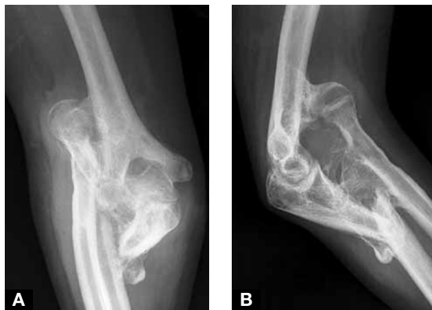
Figure 1. (A) Anteroposterior and (B) lateral radiographs at presentation show patient's chronic type 1 Monteggia fracture with 30° angulated ulnar malunion and proximal radioulnar synostosis.

The patient was taken to the operating room and placed supine on the operating table. The arm was