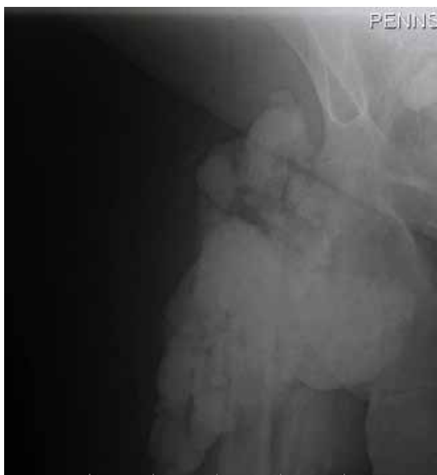
Figure 3. Plain radiograph of right hip shows soft-tissue calcifications preventing optimal visualization of cortical borders of proximal femur.

subcutaneous fat were excised. After all reachable fluid collections were evacuated, the field was irrigated, and 2 Hemovac drains were placed, anteriorly and posteriorly. Estimated blood loss (EBL) for the procedure was 1300 mL. Two units of packed red blood cells were transfused during surgery, and 2 more units were given on postoperative day 1.