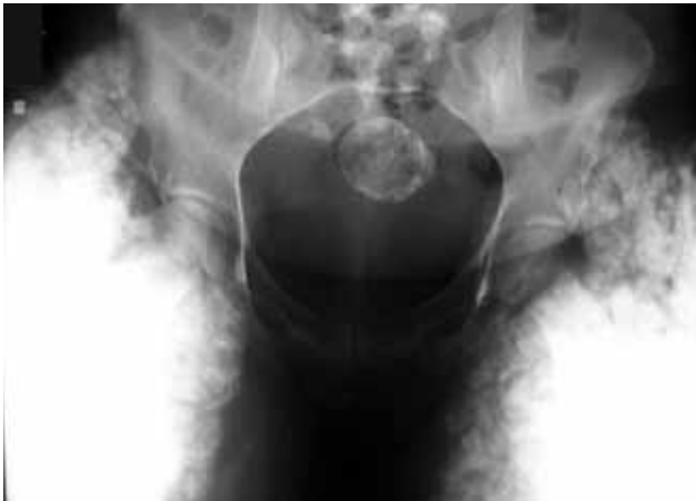
Figure 1. Plain anteroposterior radiograph of pelvis shows diffuse soft-tissue calcification in thighs bilaterally without involvement of hip joints.