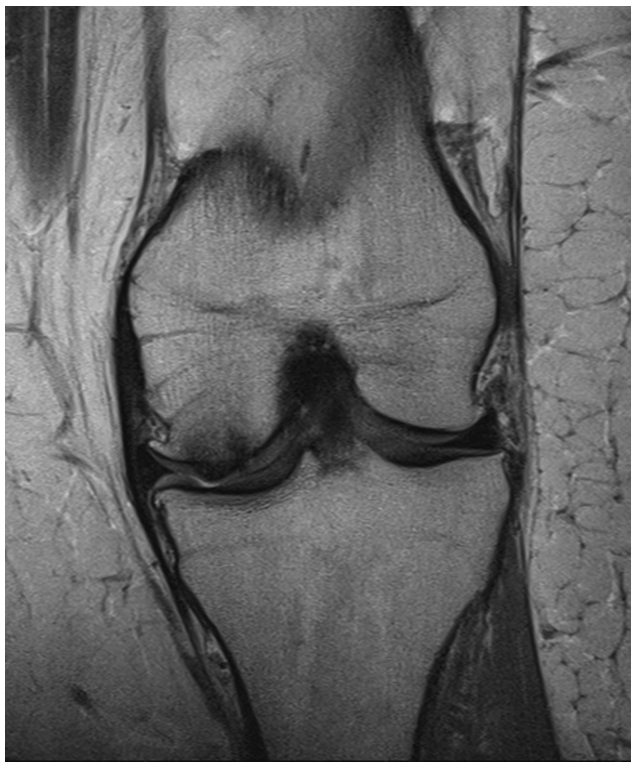
Figure 2. Preoperative coronal T 1 -weighted magnetic resonance imaging shows prominence of osteochondral graft in distal left knee medial femoral condyle. Note adjacent tibial plateau chondral surface.

showed moderate varus alignment with a mechanical axis passing through the middle of the medial compartment of the left knee. Magnetic resonance imaging (MRI) of the involved knee showed a 2-mm step-off/prominence at the recipient site on the medial femoral condyle caused by incongruence of the osteochondral autograft transplantation plug (Figure 2). Given the debilitating pain, mechanical symptoms, and MRI findings, arthroscopy was performed to evaluate the patient's candidacy for proximal tibial osteotomy and a possible osteochondral allograft. During surgery, the lateral aspect of the notch (donor site) showed dense overgrowth of fibrous tissue that engaged the inferior pole of the patella past 90° of flexion. Evaluation of the medial compartment revealed a 2- to 3-mm bony prominence of the recipient autograft (Figure 3). The anterior aspect of the autograft had some cartilage delamination. The medial tibial plateau had a full-thickness kissing lesion in a linear groove, from posterior to anterior, corresponding to the prominence of the autograft (Figure 4). When the knee was taken through a range of motion in flexion and extension, the tibial plateau lesion from anterior to posterior engaged the proud osteochondral graft recipient site.