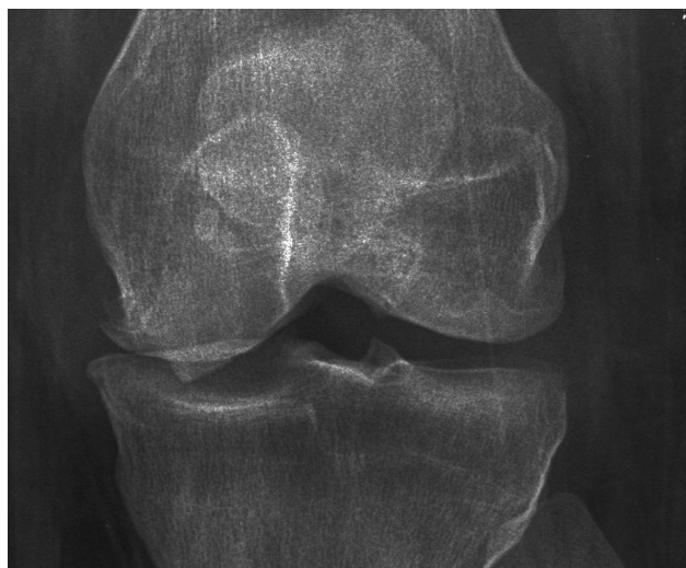
Figure 1. Preoperative anteroposterior radiograph of left knee shows bony irregularity at distal medial femoral condyle.

A 23-year-old white woman presented with a 3-year history of left medial knee pain, locking, and catching that developed after 2 left knee surgical procedures. After left knee debridement of an unstable osteochondritis dissecans defect of the medial femoral condyle 9 years earlier, she underwent an osteochondral autograft transplantation procedure, with the donor site being the distal aspect of the trochlear groove. At presentation, her pain was most noticeable with walking stairs, kneeling, and squatting. She noted issues with locking and catching. Clinical examination revealed a left knee effusion as well as pain and crepitation along the medial joint line to valgus stressing at 30° of knee flexion. Repeat radiographs showed a prominent and obliquely oriented osteochondral transfer graft plug of the medial femoral condyle (Figure 1). Long-leg standing radiographs