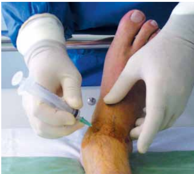
Figure 1. Radiosynovectomy (rhenium-186) of ankle in patient with inhibitor and chronic hemophilic synovitis.

Between the second and fourth decades of life, many hemophilic patients develop arthropathy. At this stage, possible treatments include alignment osteotomy,