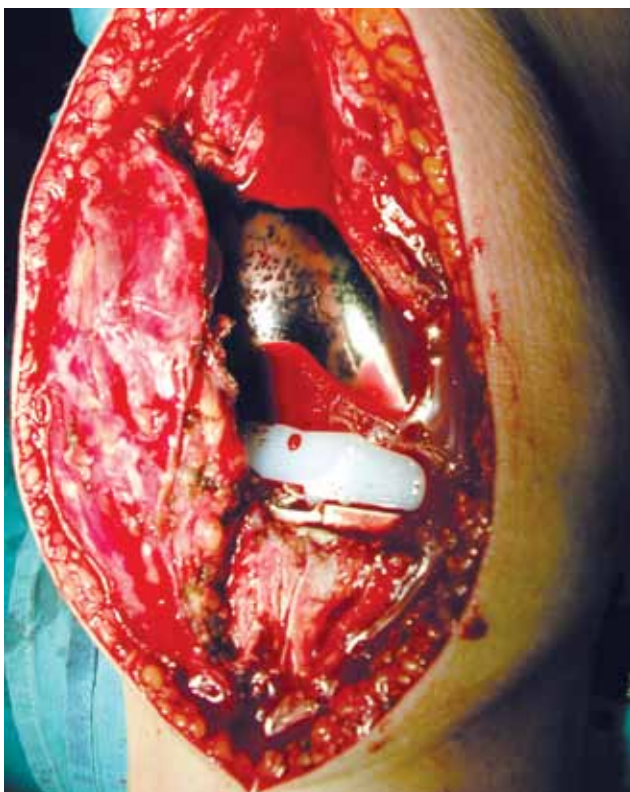
Figure 3. Patient with inhibitor underwent left total knee arthroplasty. Note normal bleeding after tourniquet release and implantation of prosthetic components.

arthroscopic joint débridement, arthrodesis, and total joint arthroplasty. 15 For the hip, cemented or press-fit uncemented components can be used; for the knee, a posterior-stabilized cemented design is advised. In hemophilia, muscular problems must not be underestimated, given the risk for developing compartment syndrome, which requires surgical decompression, and pseudotumors, which require surgical removal or percutaneous management.