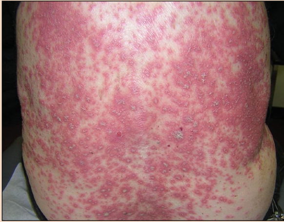
FIGURE 2. Pustular psoriasis.