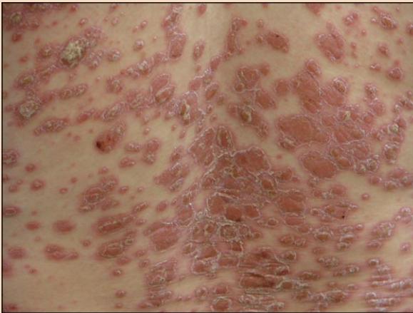
FIGURE 3. Pustular psoriasis.