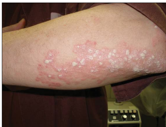
FIGURE 1. Plaque psoriasis.

The advent of biologic therapy has greatly changed the course of psoriasis treatment. A more detailed discussion on conventional (“prebiologic”) therapies for