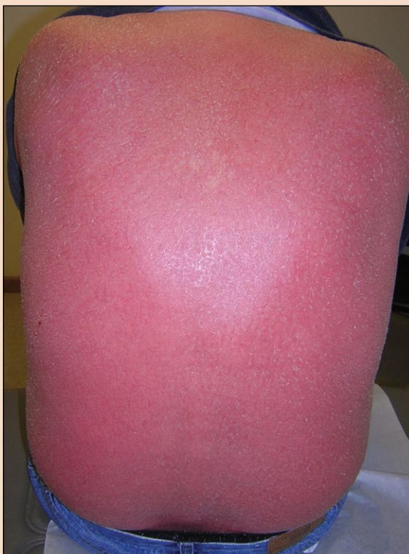
FIGURE 4. Erythrodermic psoriasis.

Paradoxically, use of anti-TNF agents may infrequently flare psoriasis; this patient's erythroderma was temporally related to initiation of adalimumab therapy. Adalimumab use was discontinued, and improvement was noted following a short course of oral systemic steroids. To date, the patient's psoriasis has been most difficult to control.