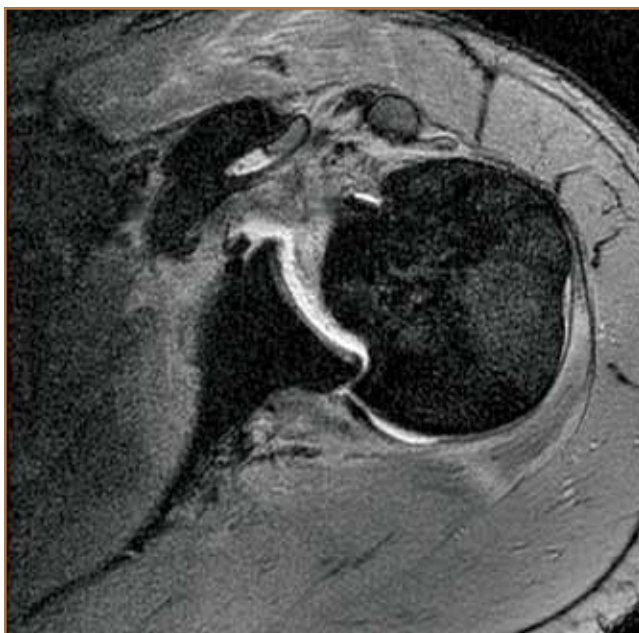
Figure 2. Axial T2-weighted MRI arthrogram of the left shoulder, taken 2 weeks postinjury, demonstrating a posterior glenohumeral dislocation, with large reverse Hill-Sachs lesion, and complete tear of the subscapularis.

Postoperative rehabilitation included physical therapy starting 2 weeks after surgery, with abduction and forward flexion exercises in 20° of external rotation. By 6 weeks, his therapy