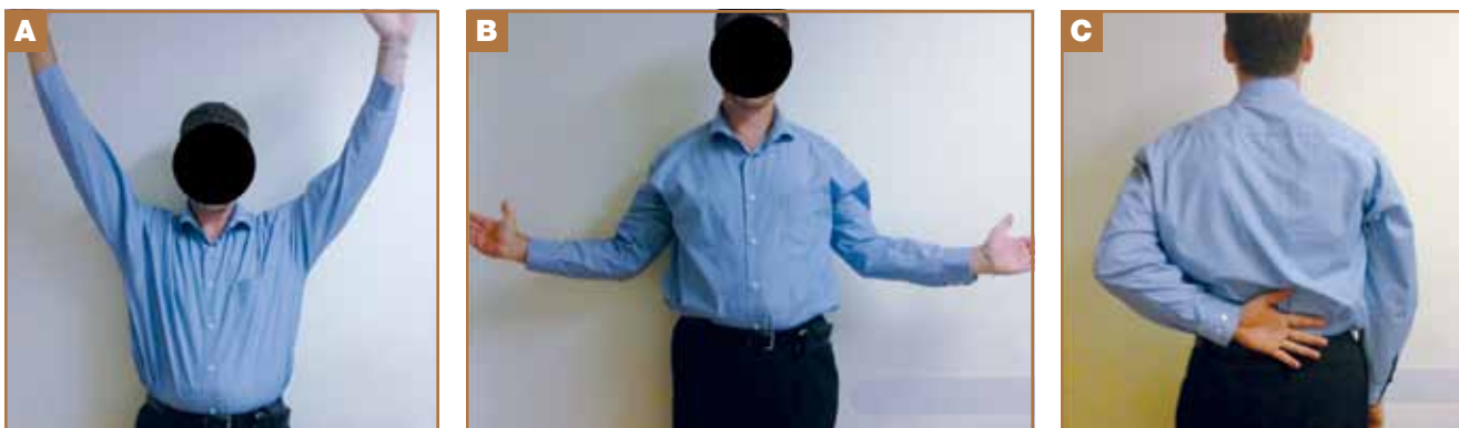
Figure 3. Six-month postoperative clinic visit demonstrating near full forward flexion (A), external rotation (B), and internal rotation (C).