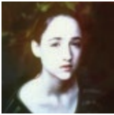
Teen girl brain