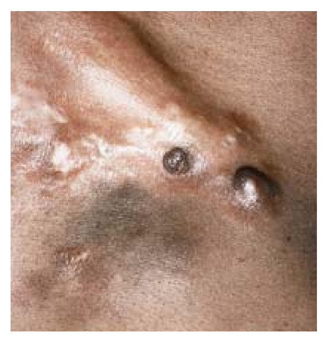
FIGURE 1. Case I. Ill-defined dermatofibrosarcoma protuberans at the left infraclavicular area. Protuberant, soft, hyperpigmented nodules were located at the lateral-most aspect of the atrophic hypopigmented plaque. An area of hyperpigmentation extended inferiorly.