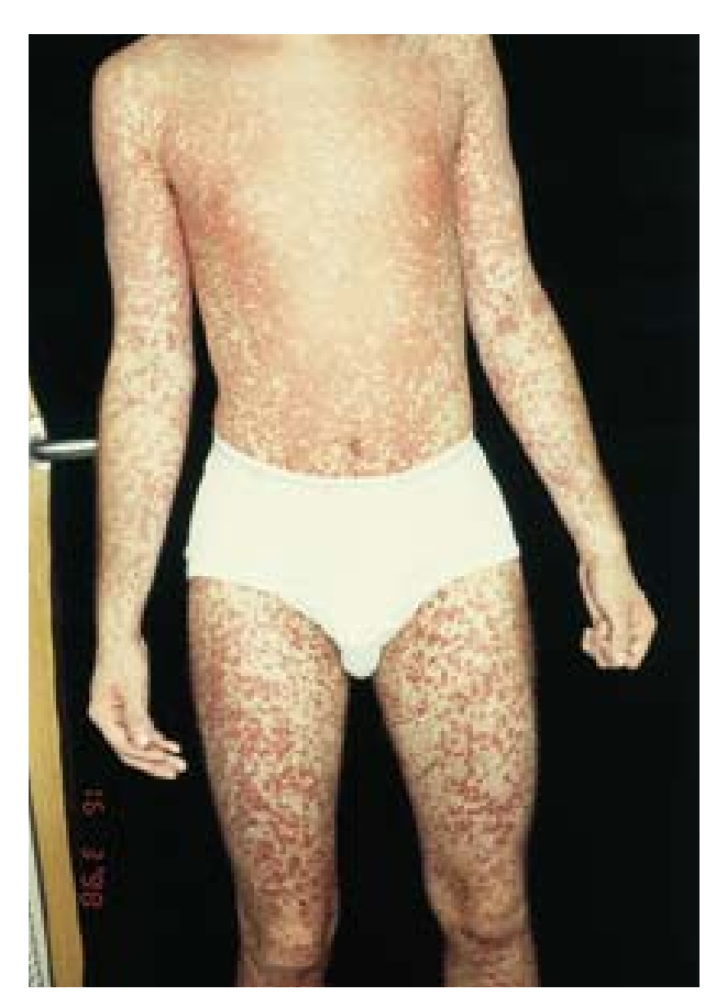
FIGURE 1. Anterior view of the generalized eruption of erythematous macules, papules, and patches.

A 20-year-old white man presented to the dermatology clinic for evaluation of a mildly pruritic, disseminated cutaneous eruption of erythematous macules, papules, and patches. He was well until 2 weeks be-