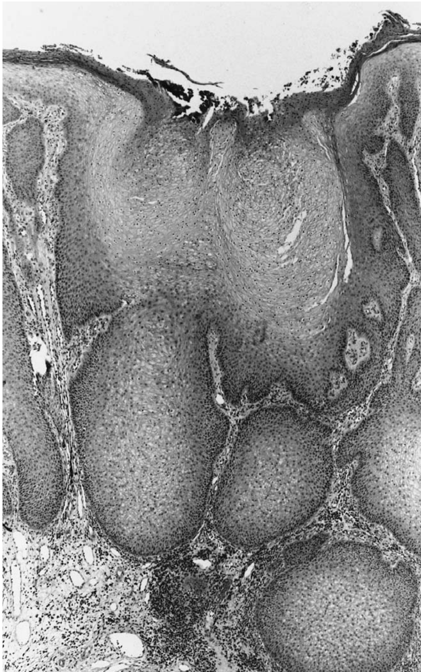
FIGURE 3. Shave biopsy specimen from lip lesion. Note interconnected lobules of large pale keratinocytes with minimal cytological atypia consistent with verrucous carcinoma (H&E; original magnification, \times 40 ).

nal series, 11 of 18 (61%) patients chewed tobacco. The Medina et al 5 series of 107 patients had an 84% prevalence of tobacco use including smoking, chewing, and snuffing. The Vidyasagar et al 10 series of 107 Indian patients found a 79% habit of chewing “pan” (a mixture of lime, betel nuts, betel leaf, and tobacco). Our patient denied tobacco use. Several HPV types have been associated with oral verrucous carcinoma.