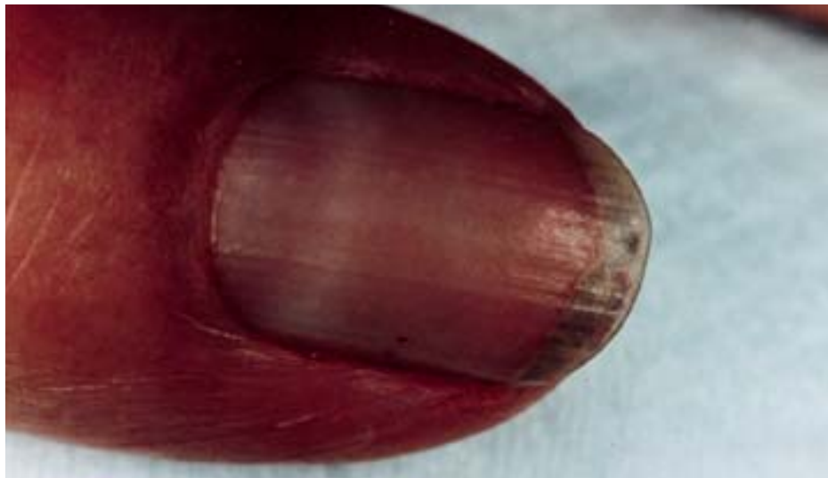
FIGURE 2. Transverse white nail band of Case II.

sequently grew S. intermedius . The patient received an 8-week course of appropriate antibiotic coverage with resolution of the empyema.