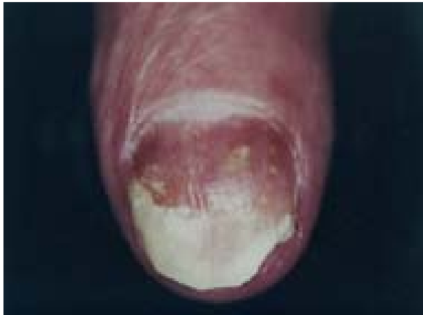
FIGURE 3. Decreased paronychia and yellow nail discoloration after 1 month of intermittent fluconazole therapy.