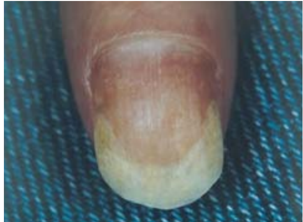
FIGURE 4. Resolution of paronychia with nail regrowth after 7 months of therapy.

4-month period resulted in re-attachment and partial clearing of the nail plate by May 1997. Within 6 weeks of discontinuing the medication, however, the nail infection recurred with nail detachment.