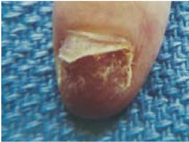
FIGURE 1. Near-complete onycholysis, with nail cut back.